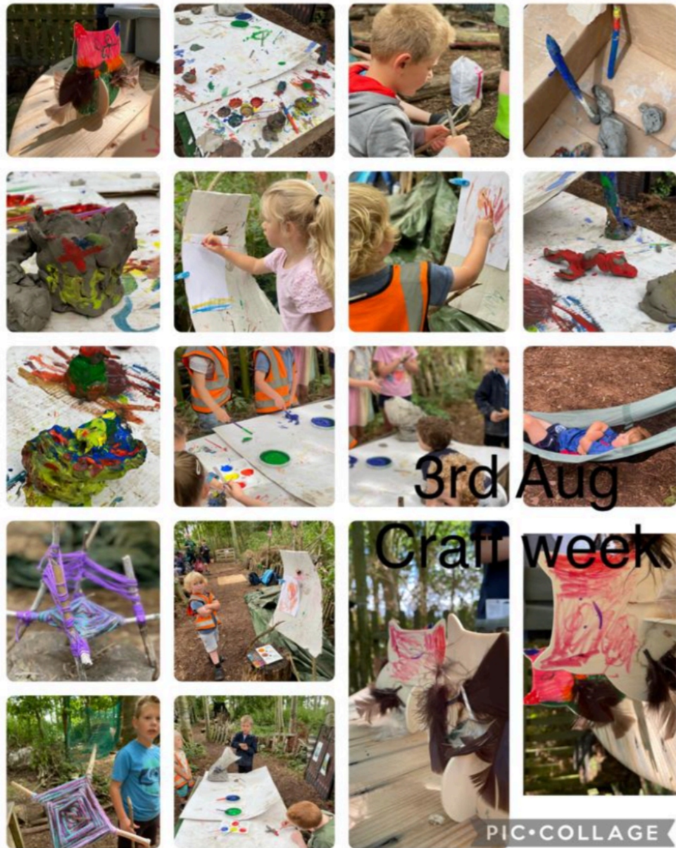
Arts and crafts