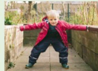
When we are warm and dry our learning is able to happen