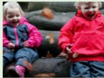
Warm waterproofing means happy learning