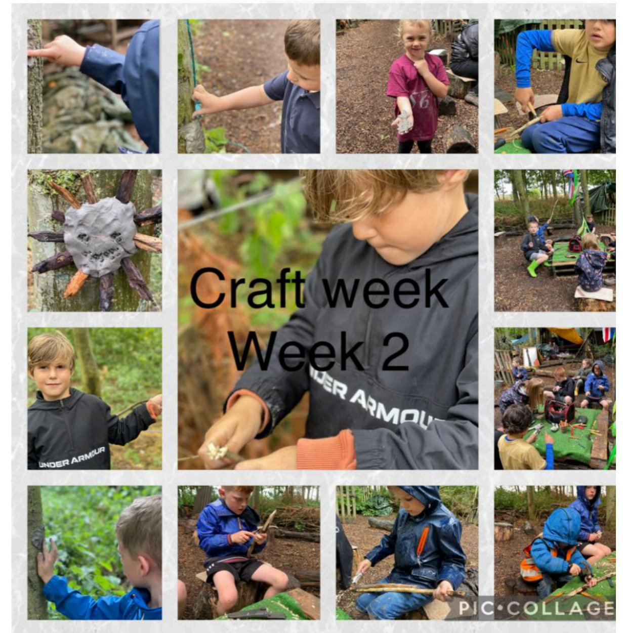
Tool skills using tools for a purpose, the blood bubble, working together.