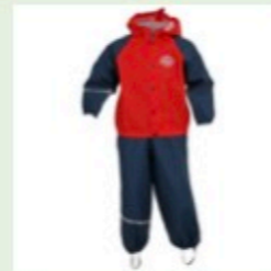
Waterproofs that can be taken off easy.