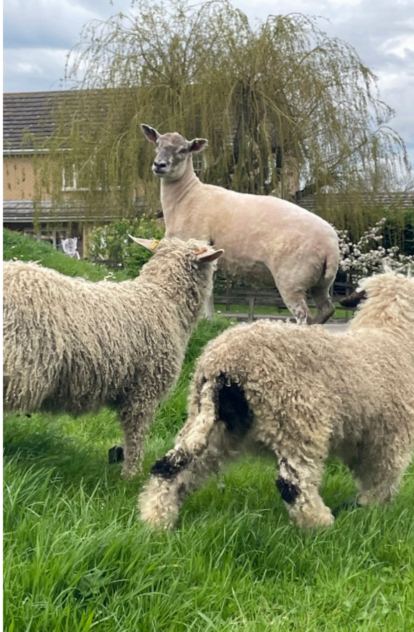
Caring for our animals learning how to care for them.