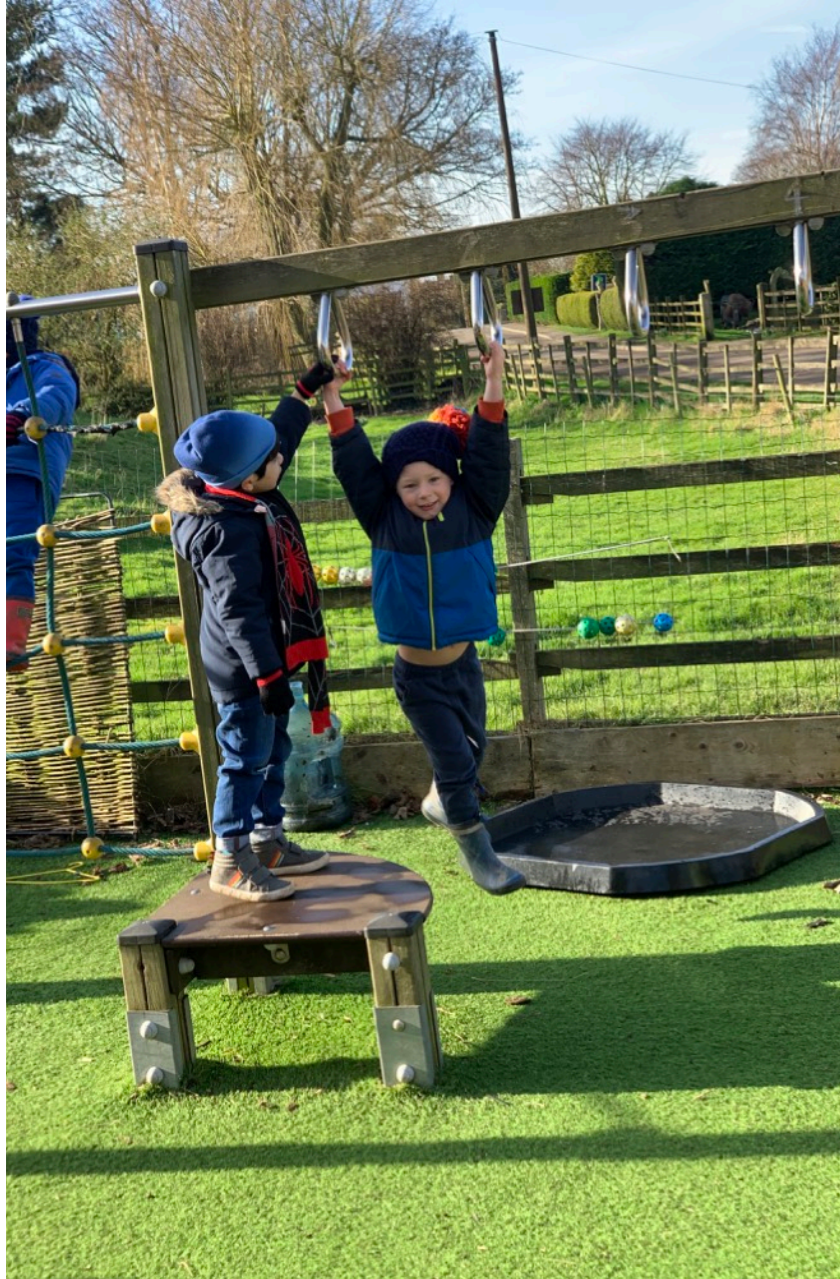
We love using the environment around us to enhance the children learning. Uper boady strenght for wrighting