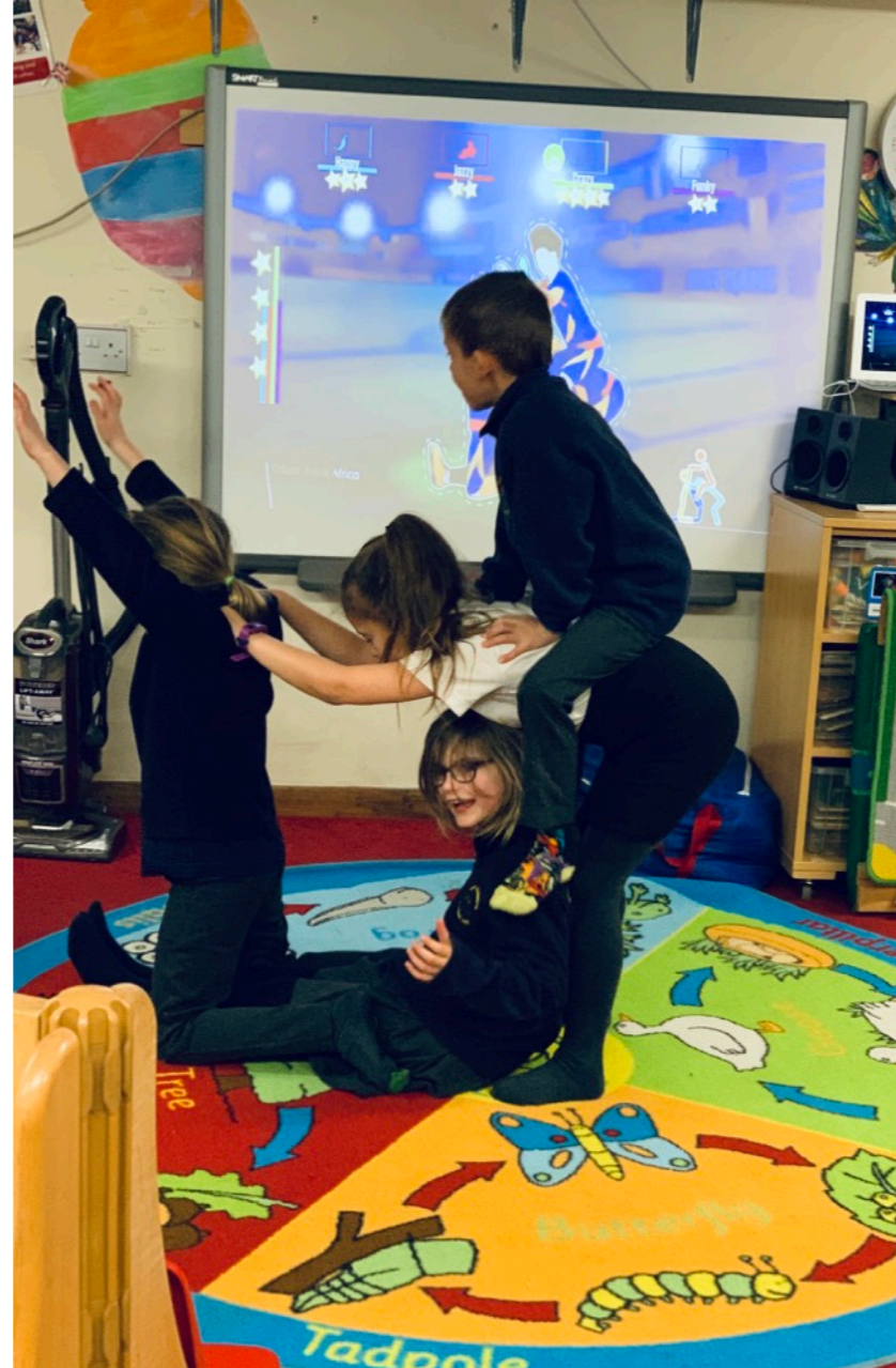
Indoor fun working together to make different shapes