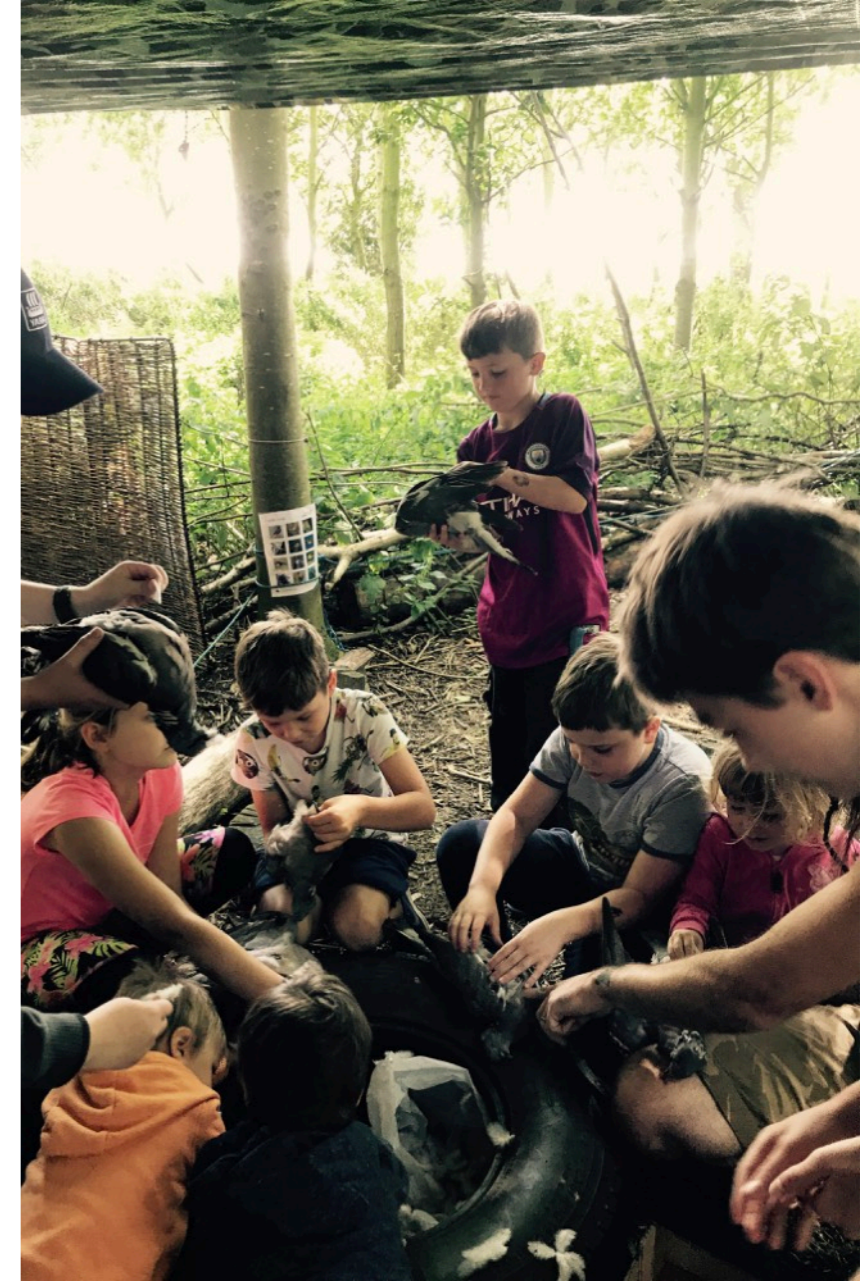
Taking part in different activities plucking a pigeon.