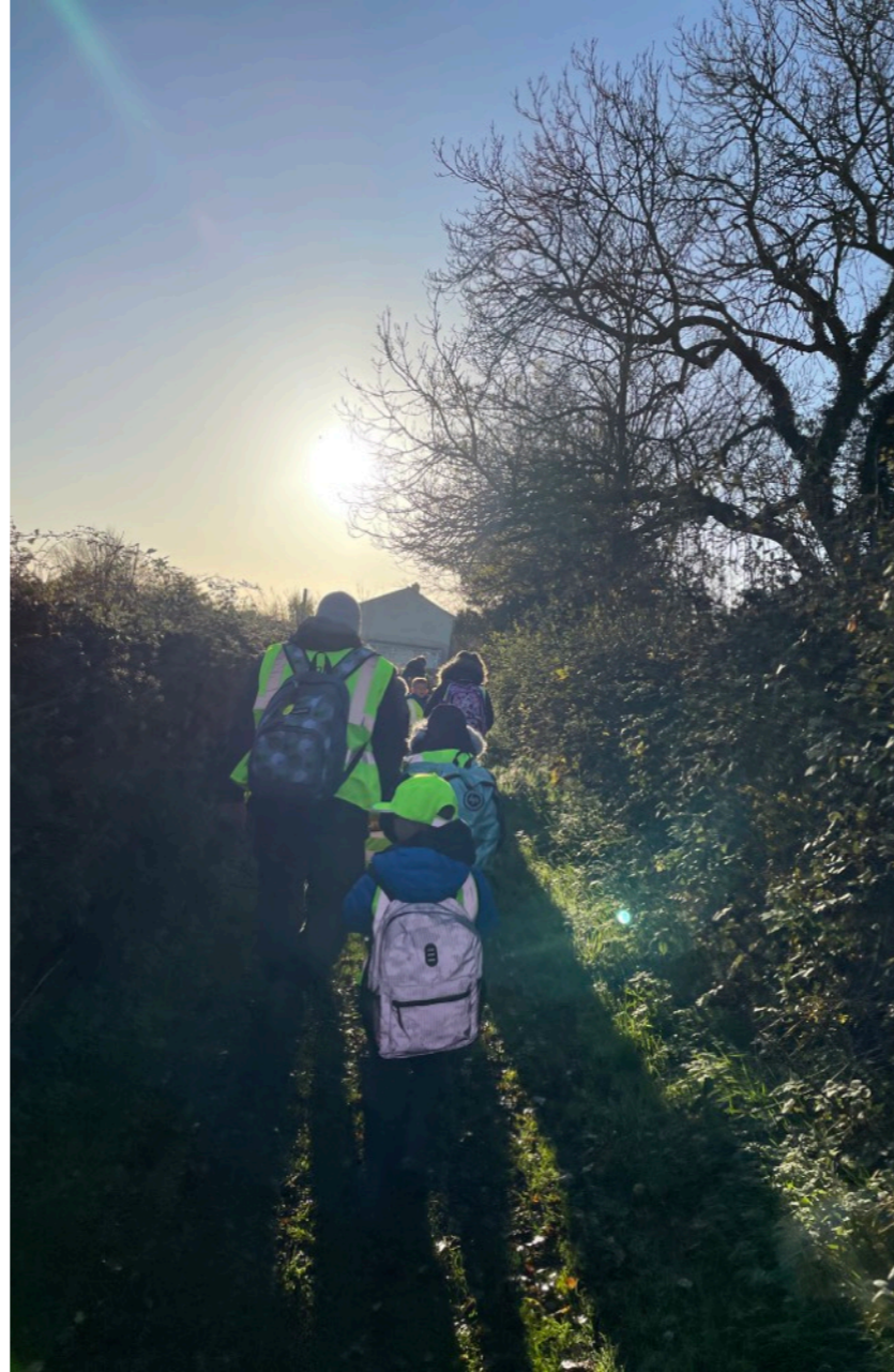
Enjoying being outside in all the different seasons