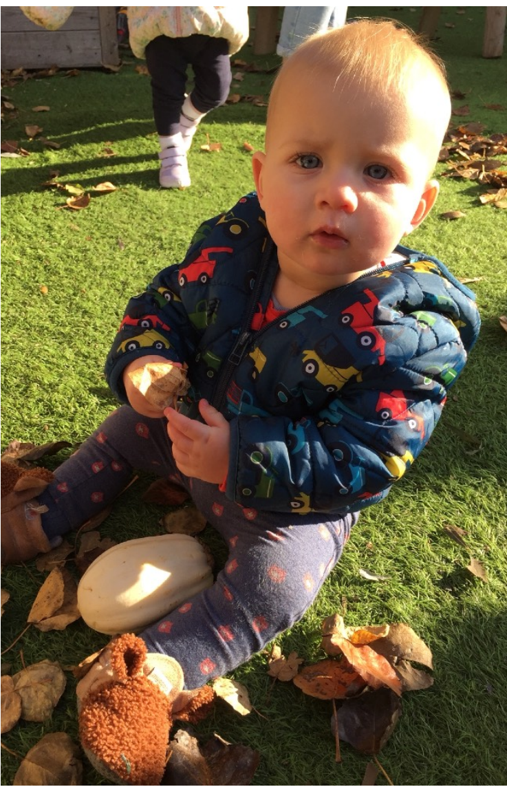
Enjoying being outside in all the different seasons