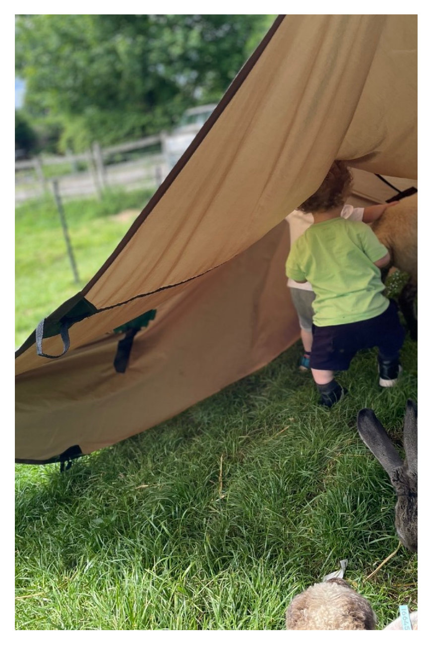
We love using the environment around us to enhance the children learning. We have been in the field with the rabbit Geff and the sheep Blossom and Baily