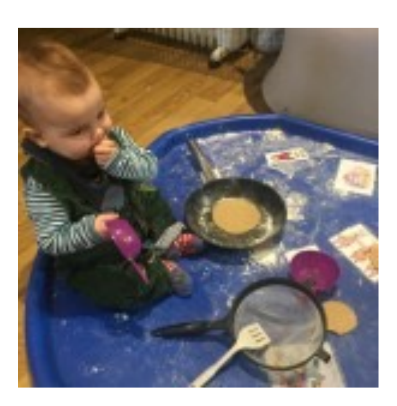
Taking part in different festivals though out the year