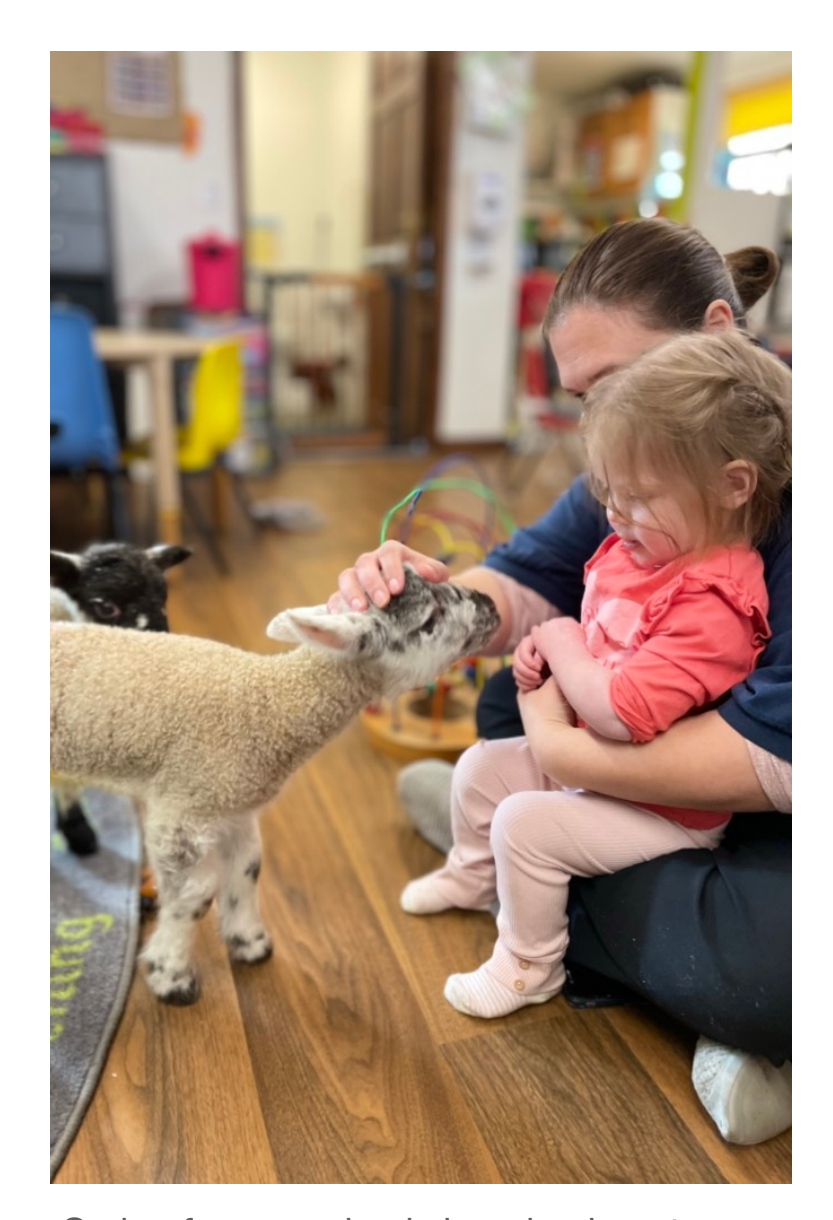
Caring for our animals learning how to touch them.