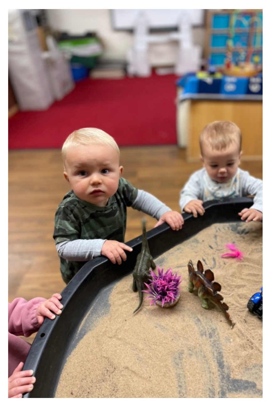
Using real items for small motor skills touching different materials picking up small objects.