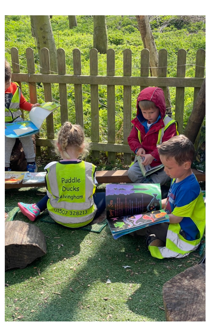
Being independent, leading their own learning through their own interest.