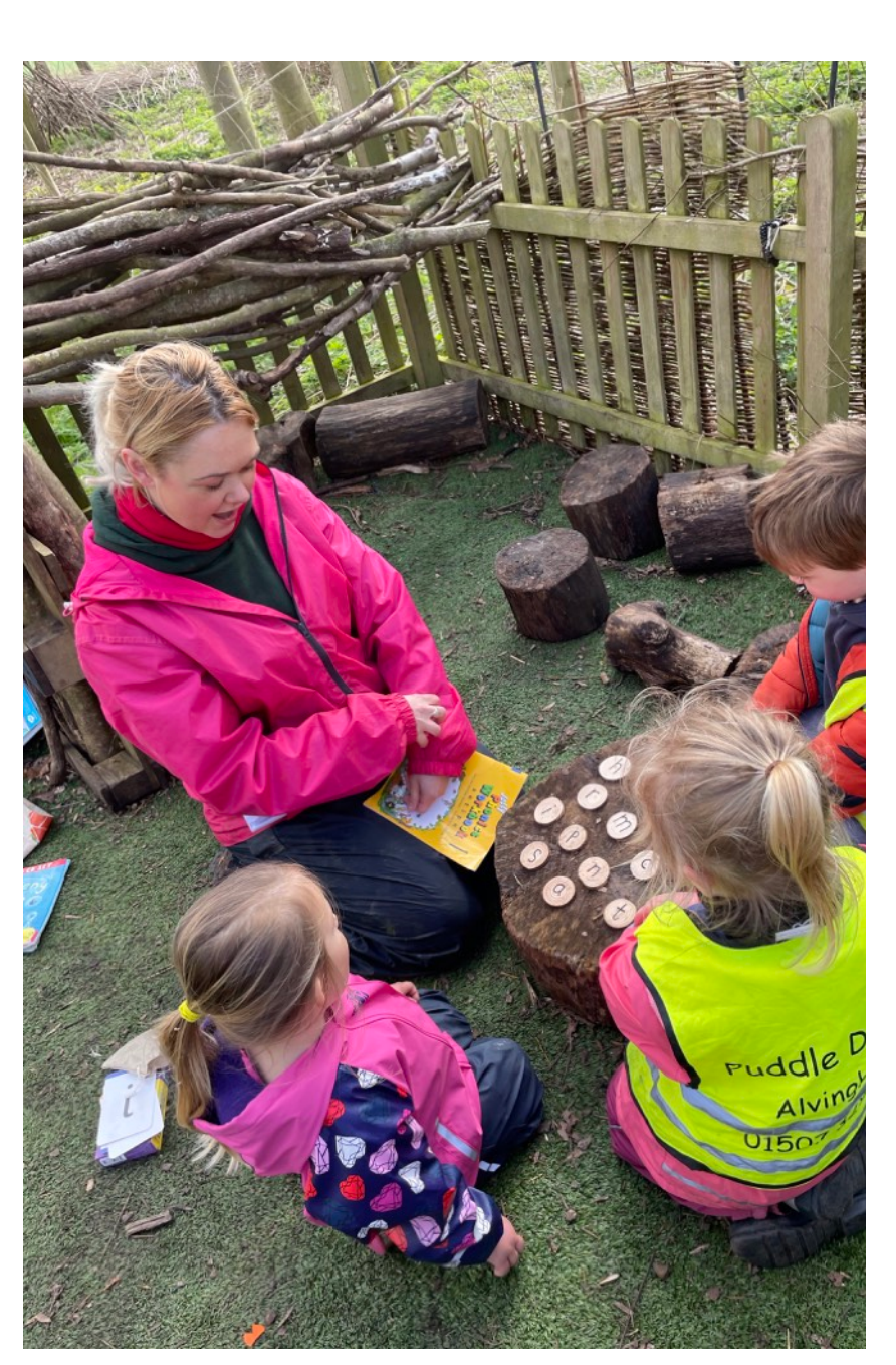
The children are able to cover Daily phonics all areas of your children's development will be covered in this outside environment.