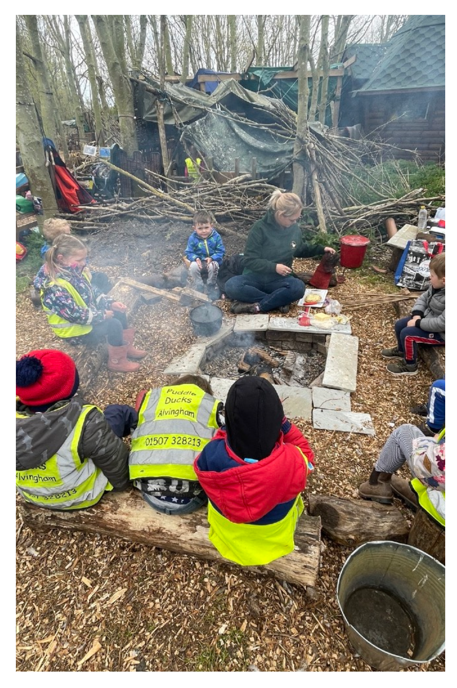
Learning how to stay safe around fire but also how to look after the fire, be safe round the fire and also how to cook on the fire.