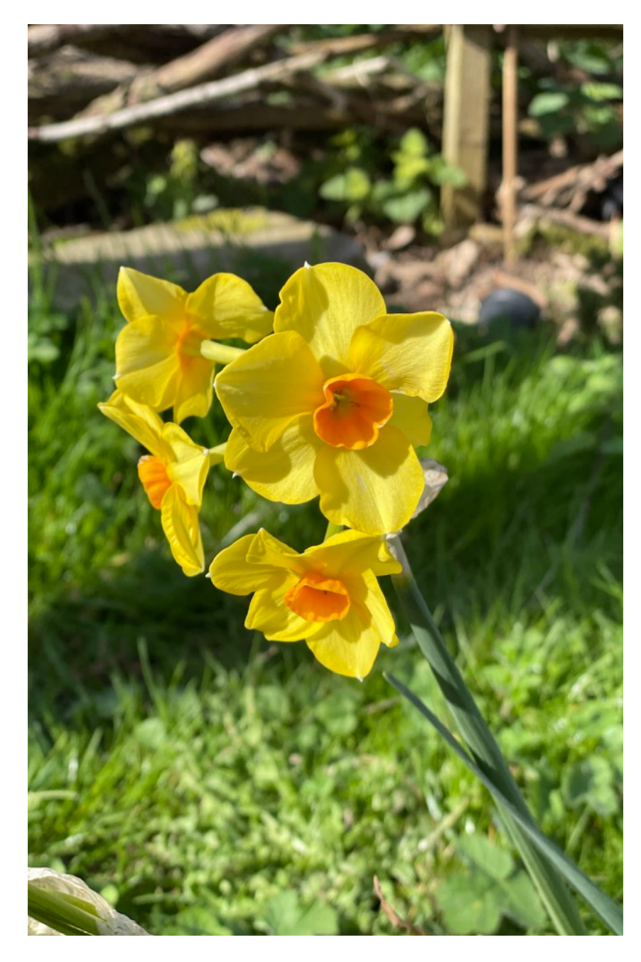
Growing our own plants just like we are growing and moulding the children into being confident learners.