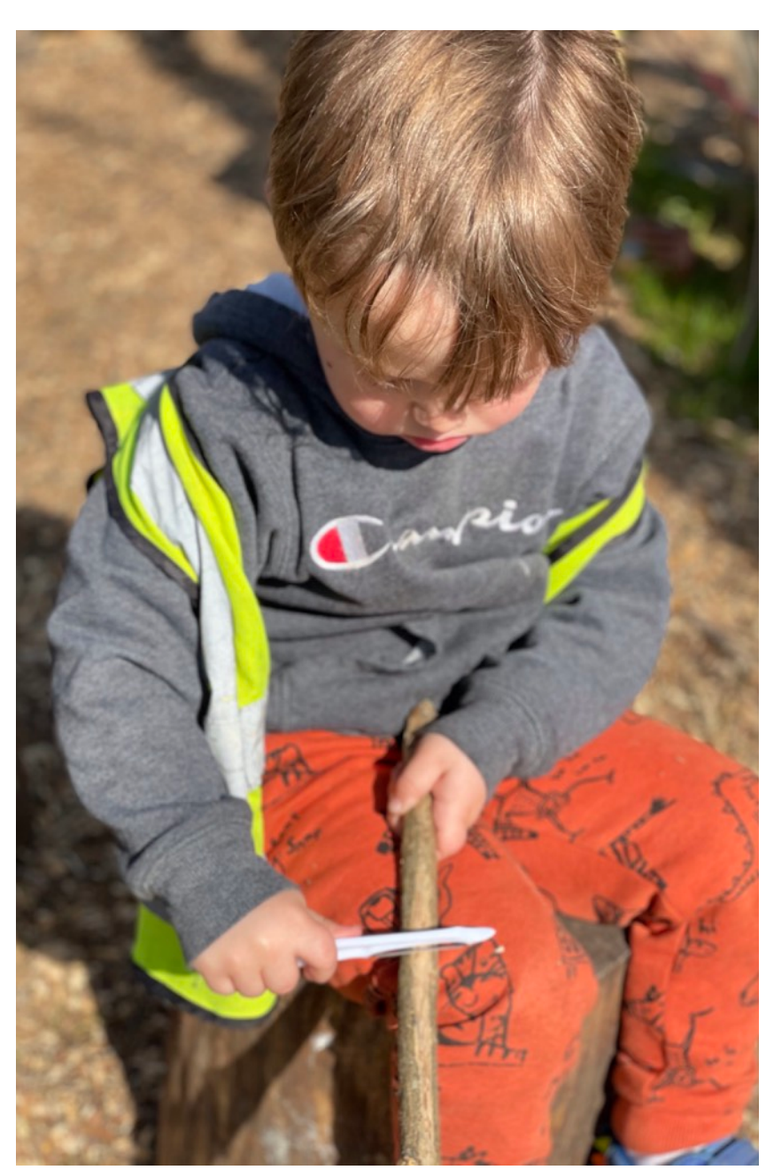
Tool skills using tools for a purpose, the blood bubble, working together.