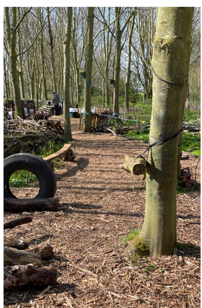
An environment that will give our woodland children the skills to become eager to learn, want to find out and develop the knowledge to learn.