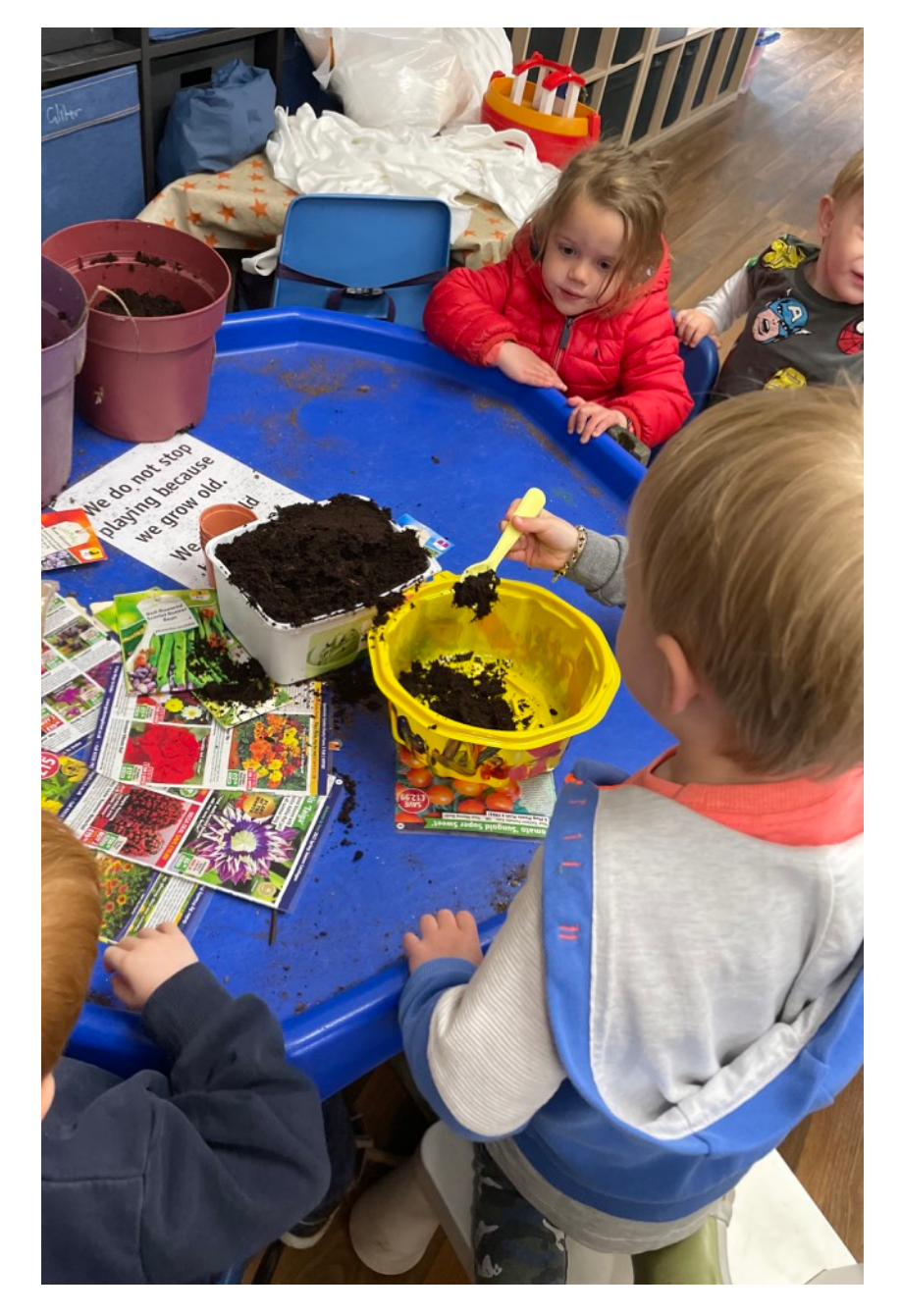
Growing our own plants just like we are growing and moulding the children into being confident learners.